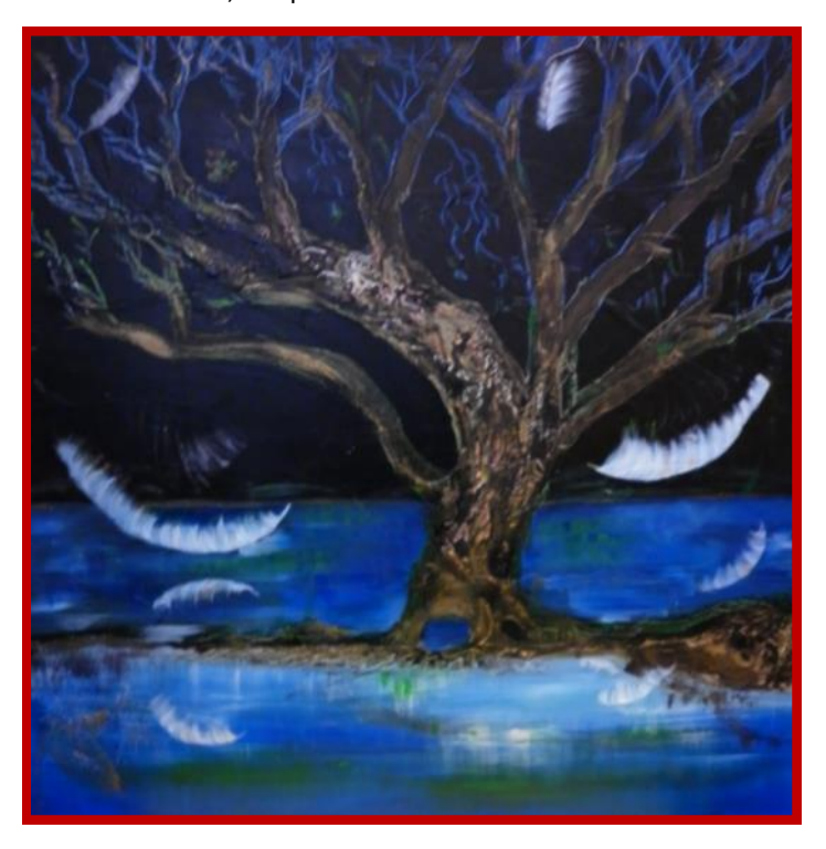
I felt like I was beyond love, I felt like I was beyond love of self, beyond love of God, beyond love of other people. Because my girlfriends, none of them realised I'd taken on board this incredible shame. And it is shame, it wasn't guilt, it was shame [for breaking a deeply held value].